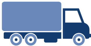
Truck and Trailer Parking