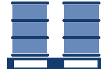
Outdoor Storage of Products, Materials and Equipment